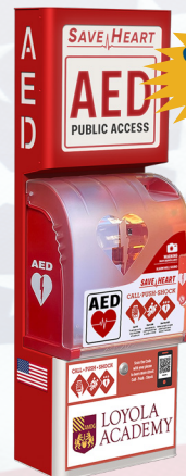
SH AV 200VHM