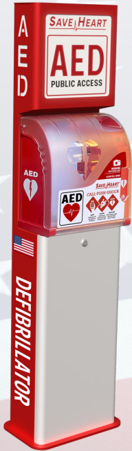
SH AV 300VHM