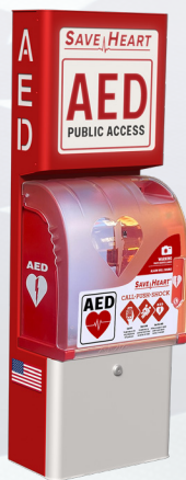
SH AV 200VHM