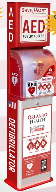
SH AV 300VHM