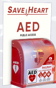
SH AV 100VHM